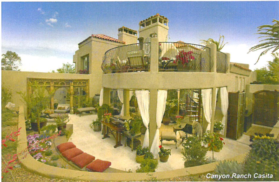
Canyon Ranch Casita