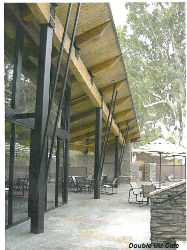
Double UU Cafe